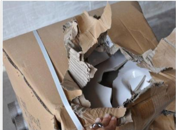
Customers suffer a lot from bad package