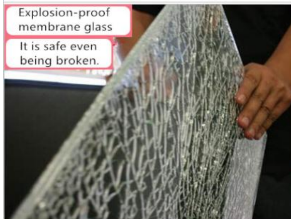
Safety is the most important point