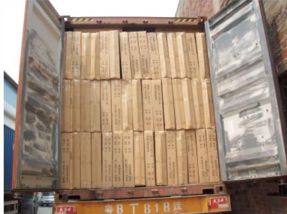
Professional loading reduce damage rate