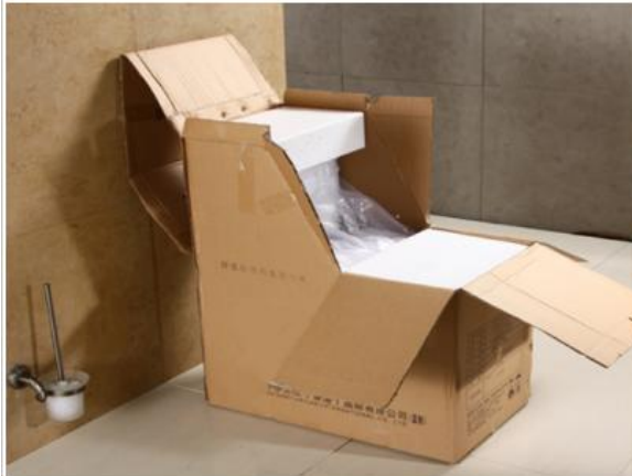
Good package is the most basic guarantee