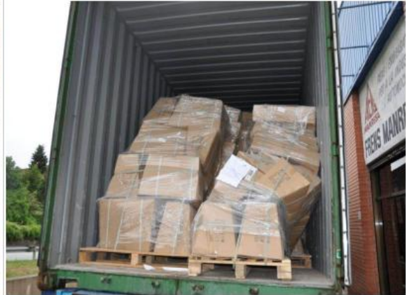
Customers suffer a lot from bad loading