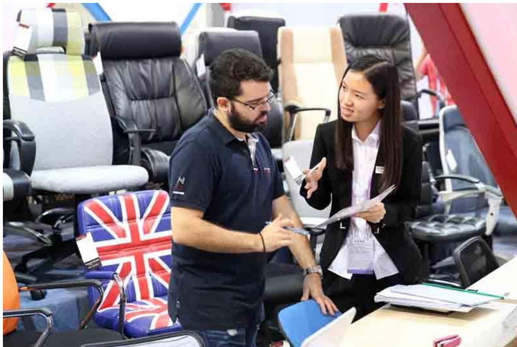
Customer purchased in Shunde Furniture City

IN 2004, China begun to be the largest exporter of furniture in the world. China manufactures most of the furniture of the leading designers in the world. These furniture designers are of course silent about this fact.